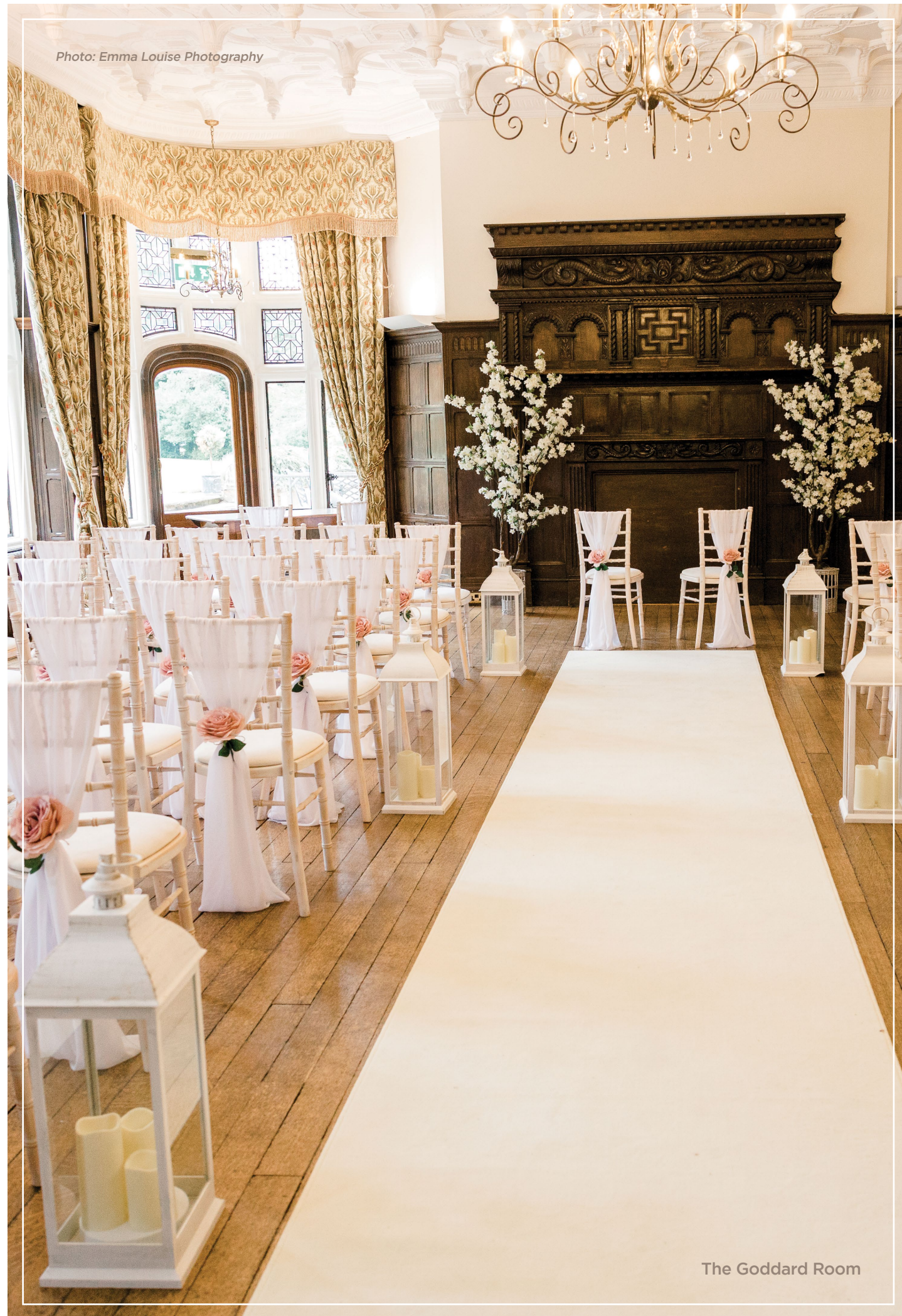
The Goddard Room